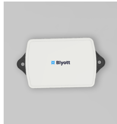
The BT-AL is a high-precision locator that will not only tell you in which room your asset is located but the specific location in the room.

The built-in battery, with optimised and ultra-low power consumption, enables users to simply plug and play; no power or cabling required.